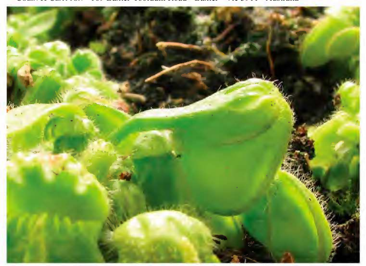
Figure 1: Cephalotus follicularis 'Clayton's T Rex'.

—Colin H Clayton • 169 Baxter-Tooradin Road • Baxter • Vic 3911 • Australia